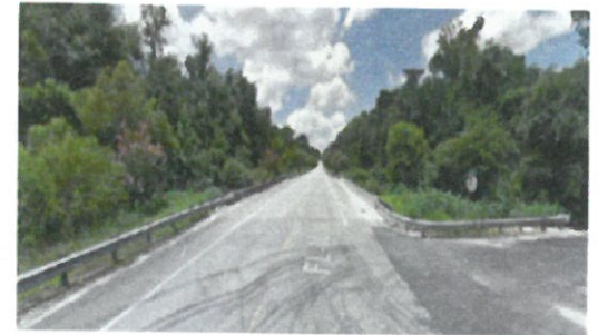
East of County Road 59 to East of Willow Street Jefferson and Leon Counties