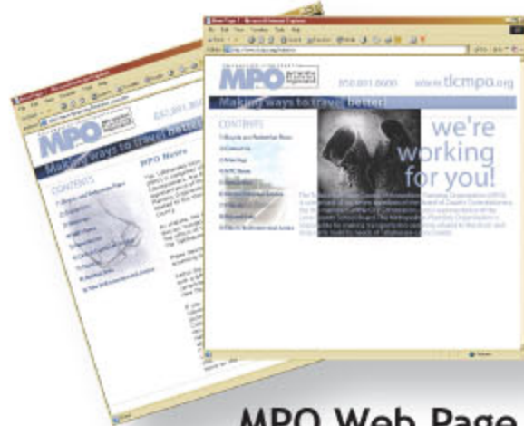
MPO Web Page

The end product of this project will provide the necessary documentation to the FDOT and Federal Highway Administration, that ensures this project complies with all Florida and Federal codes and regulations as they pertain to environmental, transportation, and public involvement. The project will require coordination between several Federal, State and local agencies and departments to adequately address the needs of all interested parties to the fullest extent possible. It is anticipated that project will begin in February of 2004.